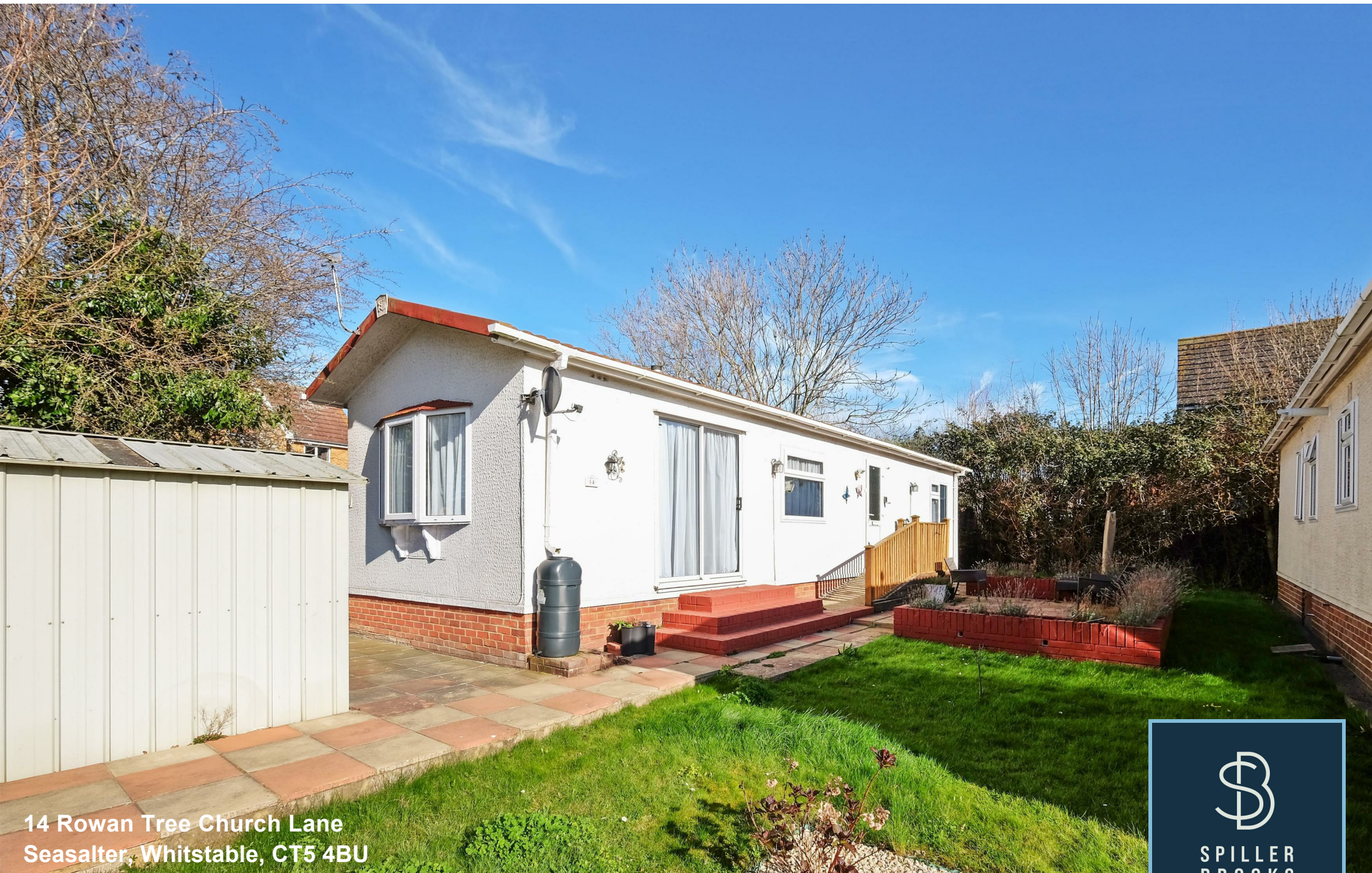
14 Rowan Tree Church Lane Seasalter, Whitstable, CT5 4BU